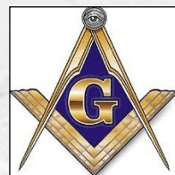
North Dakota Masonic Foundation